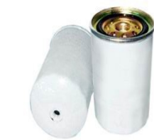
REPRESENTATIVE FC-1802 ES-13627