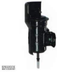
REPRESENTATIVE FS-1154 ES-13611