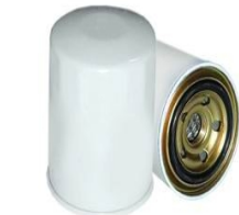
REPRESENTATIVE FC-1705 ES-13620