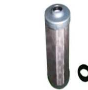
REPRESENTATIVE F-5218 ES-13629