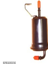
REPRESENTATIVE FS-11660 ES-13617