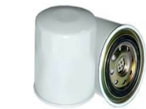
REPRESENTATIVE FC-1801 ES-13623