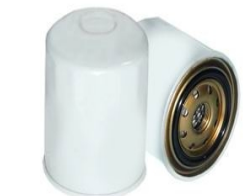
REPRESENTATIVE FC-1801-3 ES-13626