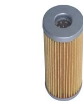
REPRESENTATIVE F-5220 ES-13631