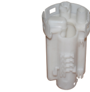
REPRESENTATIVE FS-1157 ES-13612