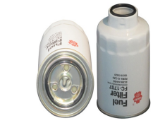
REPRESENTATIVE FC-1707 ES-13622