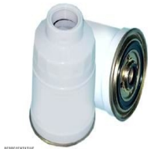
REPRESENTATIVE FC-1704 ES-13619