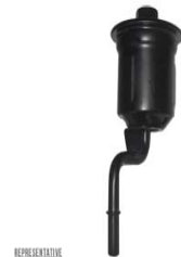
REPRESENTATIVE FS-11680 ES-13618