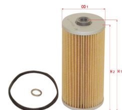
REPRESENTATIVE F-5216 ES-13628