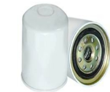
REPRESENTATIVE FC-1801-1 ES-13624