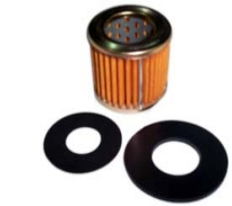
REPRESENTATIVE F-5219 ES-13630