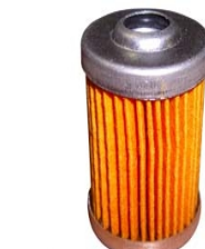
REPRESENTATIVE F-5224 ES-13633