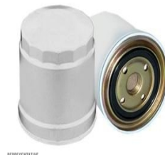
REPRESENTATIVE FC-1706 ES-13621