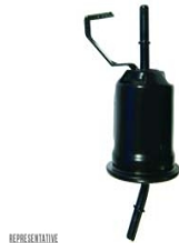
REPRESENTATIVE FS-11651 ES-13616